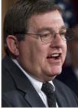
Representative Michael Burgess (TX)