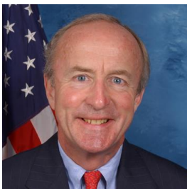
Chairman Rodney Frelinghuysen (R-NJ)