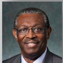
Frank Douglas Austen BioInnovation Institute